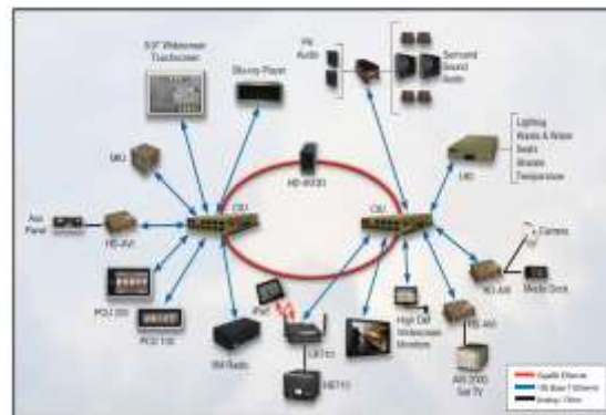
Figure 1: System architecture for developing graphic applications.

wish is your command, this is the process will help to ensuring productivity and comfort in Gulfstream's.