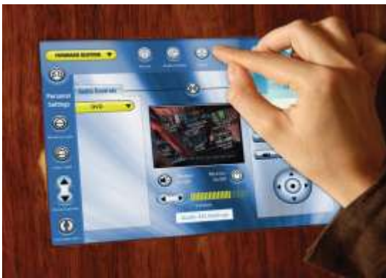
Figure 3: Automated system process for application development.

Consider the day to day updated network operations in recent application procedures we need to move from manual effort in application development to automated application which helps to reduce application work effectively [5][8]. Above developed manual effort is in real time application development its very tedious and time consuming process in application development, this also consider the effectiveness of the progressive management in committing errors in program process. Automated system will automatically develop those type applications in recent application development. In our proposed application of research variance generates an automated tool i.e. "Master Configuration Tool", this tool consists 720 end to end generation in development of those applications, this tool generates everything as an automated that reduces human effort in application development.